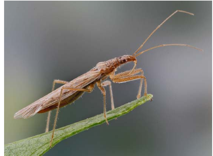
1E Damsel bug adult (Nabis)