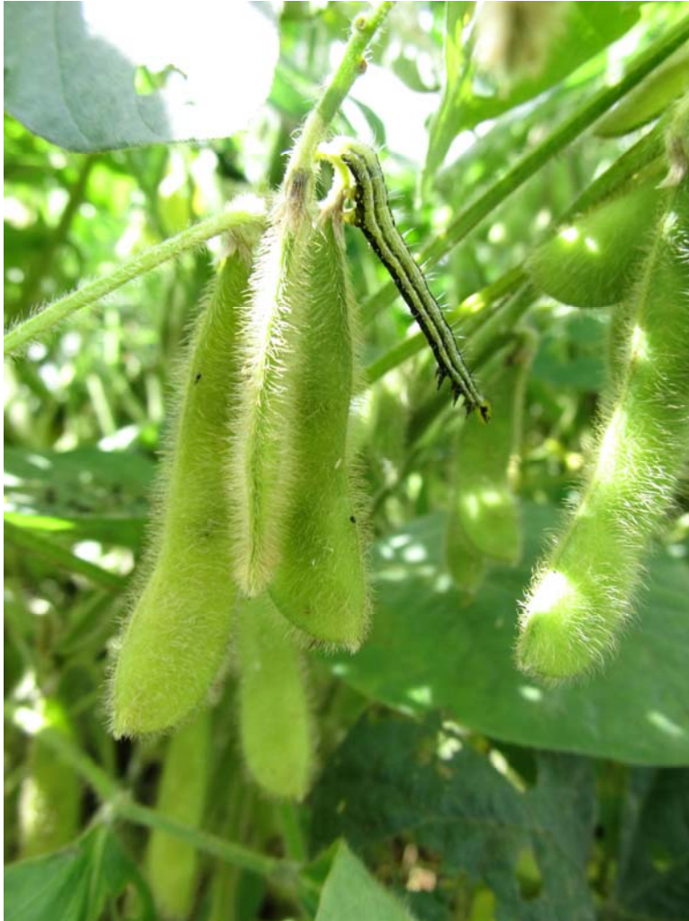
3A Looper larva