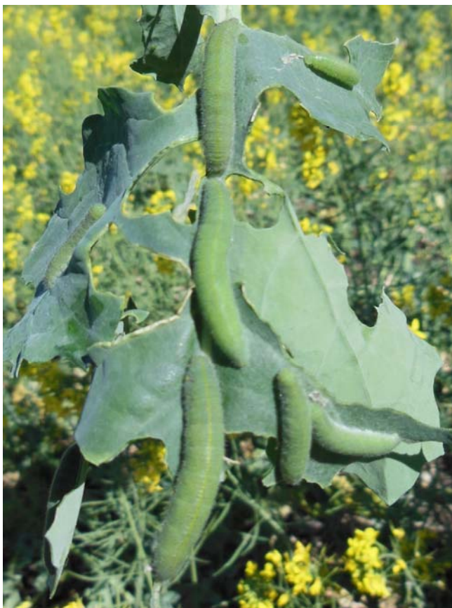
2A Cabbage white butterfly larva