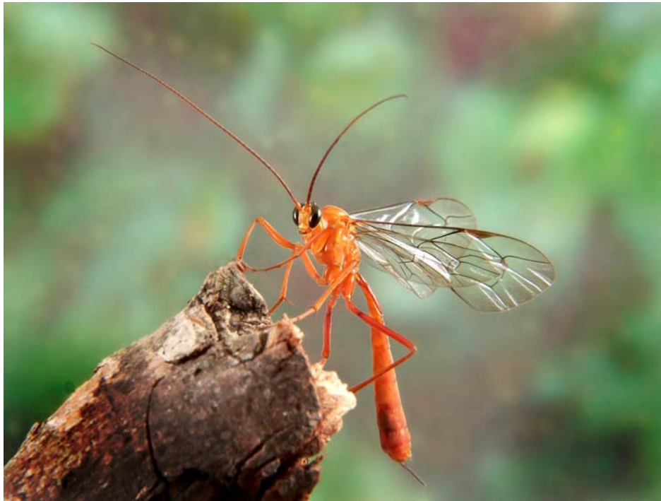
5A Orange caterpillar parasite ( Netelia )