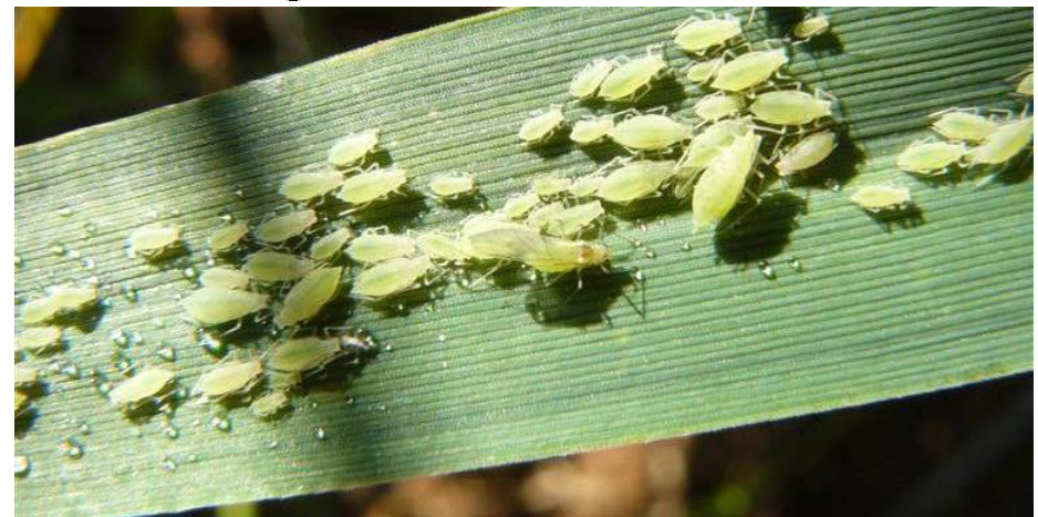
4D ex leaves in barley Rose grain aphid