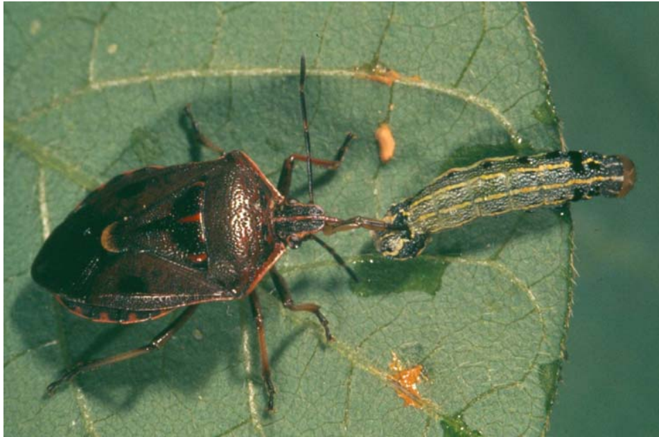
3C Glossy shield bug