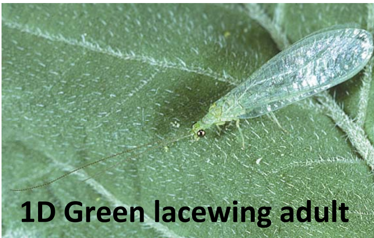
1D Green lacewing adult