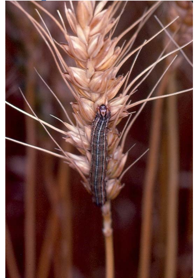
1B Armyworm larva