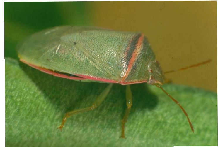
3B Redbanded shield bug (Piezodorus)