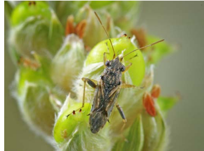
5D Rutherglen bug adults