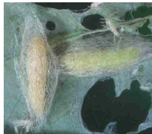
2B Diamondback moth larvae and pupae