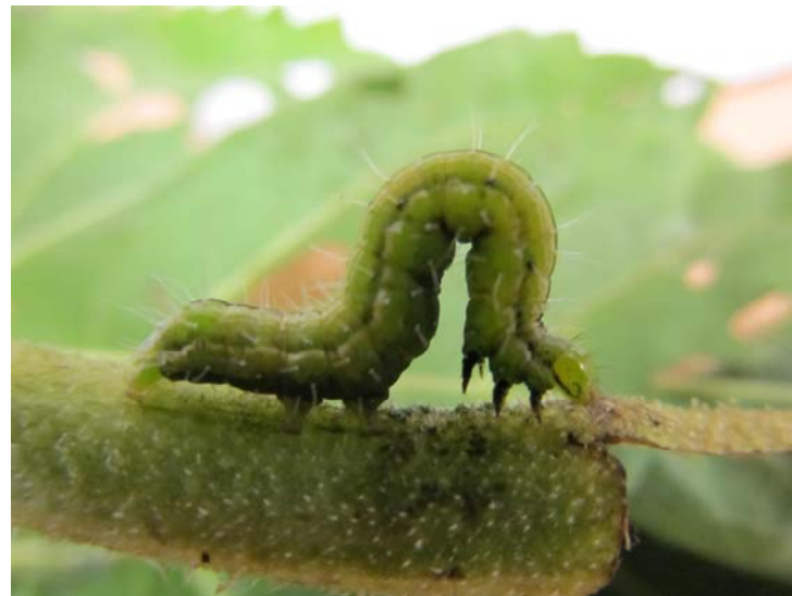
2F Looper larva