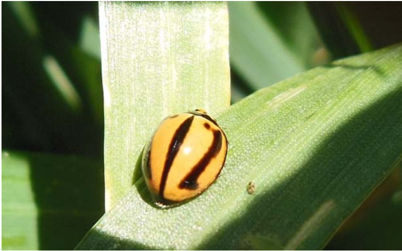
1C Striped ladybeetle adult