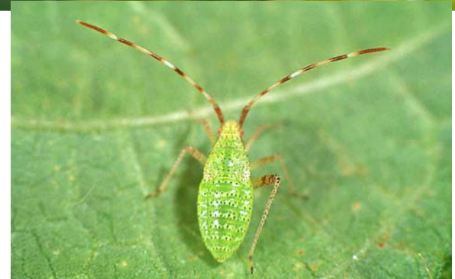
3D Brown mirid adult and nymph