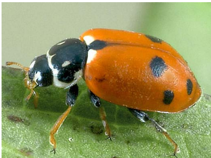
2E Hippodamia ladybeetle