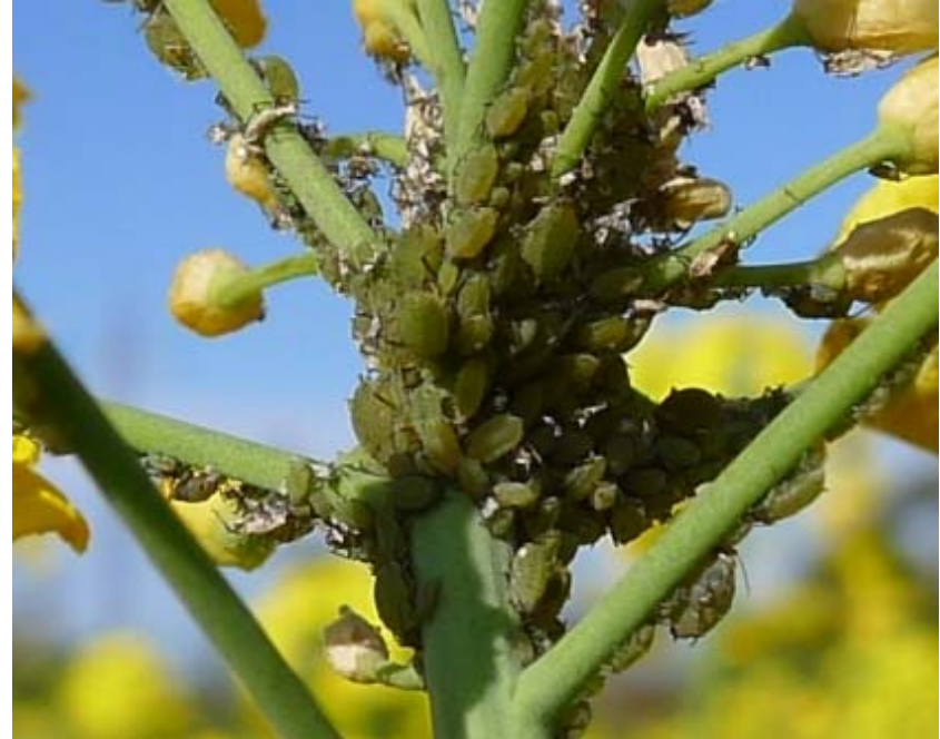
4F ex canola Turnip aphid