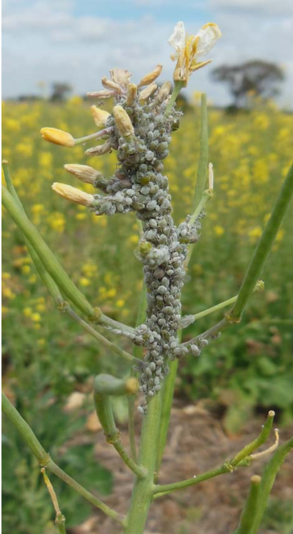
4E ex canola Cabbage aphid