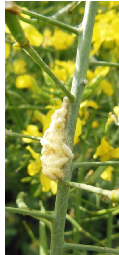
2D Apanteles cocoons (CWB larva)