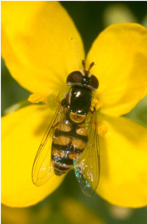
2C Hoverfly adult