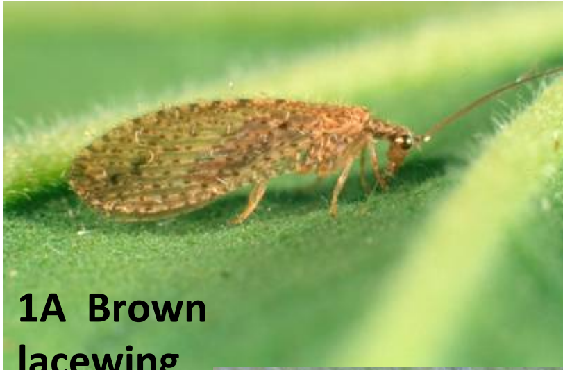
1A Brown lacewing adult