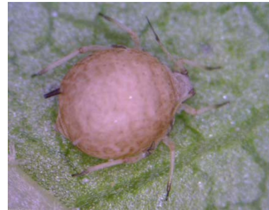
5B Aphids have been parasitised