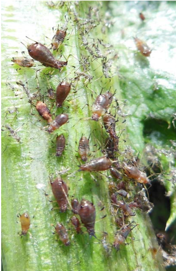
4C ex sowthistle Sowthistle aphid