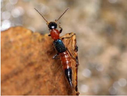
5C Rove beetle (Staphylinid)