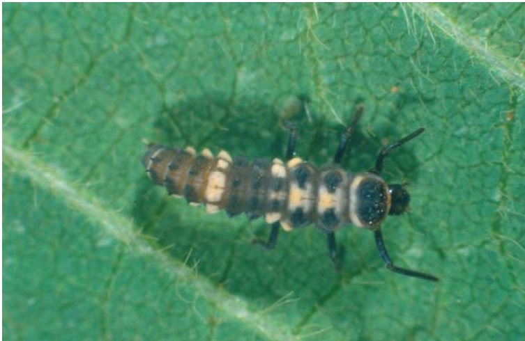
5E Ladybeetle larvae